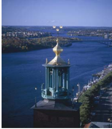
View over Riddarfjädersn, The Stockholm City Hall