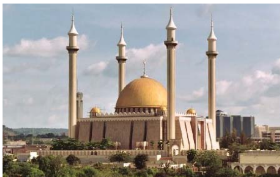
Nigerian National Mosque

The crescent shape of the city reflects the infrastructural considerations and the topography of the site. Abuja is located at 9°10'N 7°10'E. Most countries moved their embassies to Abuja and maintain their former embassies as consulates in the commercial capital of Nigeria, Lagos. Abuja's feature is Aso Rock, a 400-metre monolith left by water erosion. The Presidential Complex, National Assembly complex, Supreme Court, hotels, museums, international conference center, good roads. "Aso" means "victorious" in the language of the (now displaced) Asokoro ("the people of victory"). Other sights include the Nigerian National Mosque and the National Ecumenical Centre cathedral. The city is served by the Nnamdi Azikiwe International Airport, while Zuma Rock lies nearby.