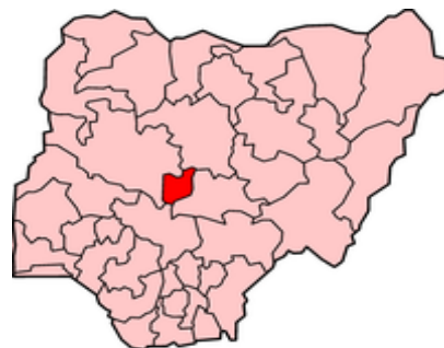
National Ecumenical Centre cathedral