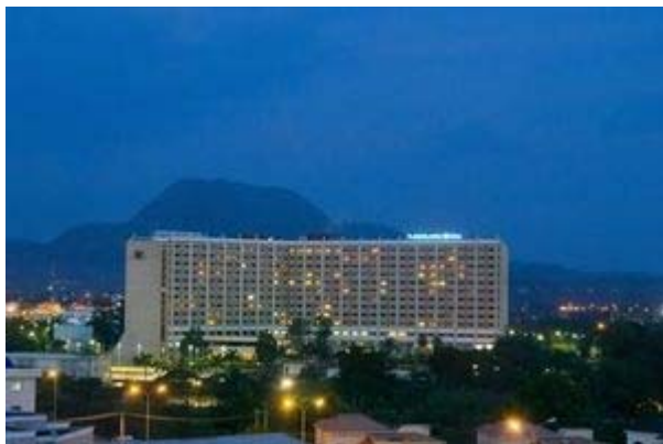
Night at Transcorp Hilton Hotel