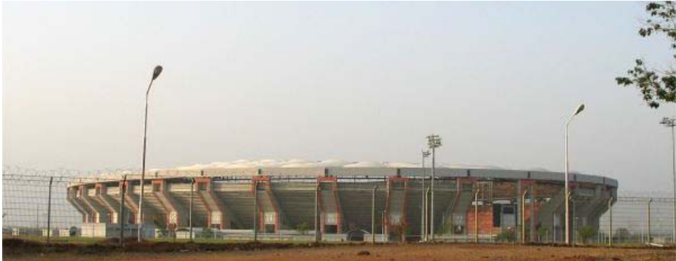
National Stadium, Abuja