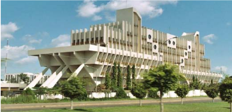
National Defence Headquarters