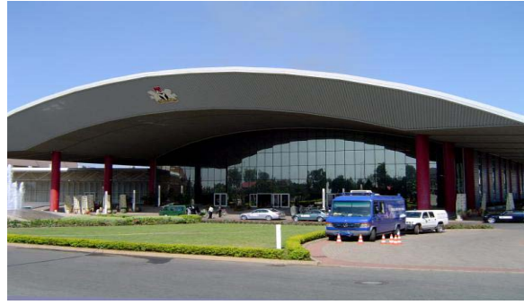
INTERNATIONAL CONFERENCE CENTRE