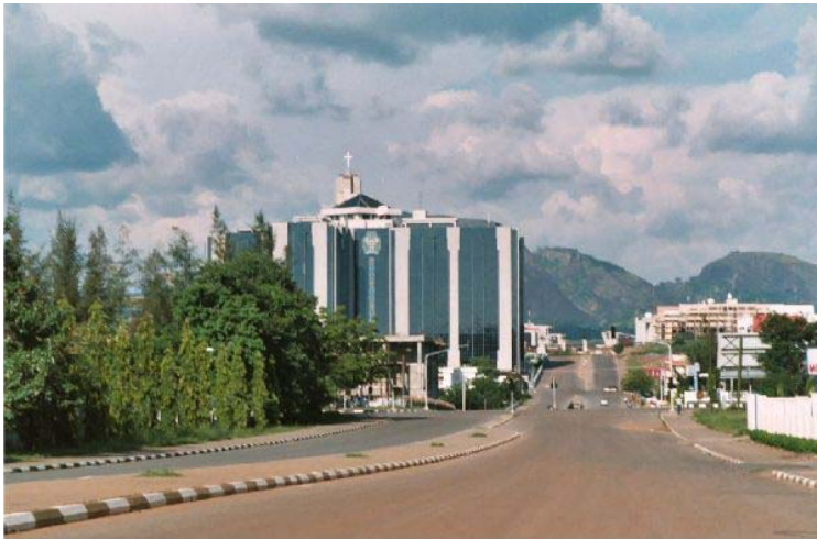
CENTRAL BANK OF NIGERIA

The city has been well planned and the Central District is located between the foot of Aso Rock and the Three Arms Zone to the southern base of the ring road. It is like the city's spinal cord, dividing it into the northern sector with Maitama and Wuse, and the southern sector with Garki and Asokoro. While each district has its own clearly demarcated commercial and residential areas, the Central District is the city's principal Business Zone, where practically all parastatals and multinational corporations have their offices located. An attractive area in the Central District is the region known as the Three Arms Zone, so called because it houses the administrative offices of the executive, legislative and judicial arms of the Federal Government. A few of the other sites worth seeing in the area are the Federal Secretariats alongside Shehu Shagari way, Aso Hill, the Abuja Plant Nursery, the Parade Square and the Tomb of the Unknown Soldier. The Brigade of Guards organizes a twenty-four hour watch at the spot and they have a colorful ceremonial change of guard. The National Mosque and National Ecumenical Church are located opposite each other on Independence Avenue.