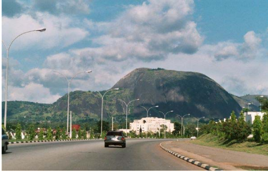
ABUJA ZUMA ROCK