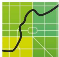
FIG Working Week 2016