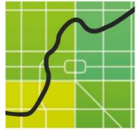
FIG Working Week 2016