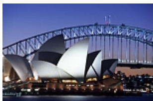
FIG Congress 2010 - Facing the Challenges – Building the Capacity, Sydney, Australia, 11-16 April 2010

Online registration is still open; see more details on the congress web site: www.fig2010.com .