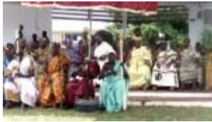
Meeting with the traditional leaders of the Accra