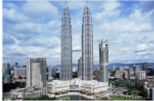
Kuala Lumpur, Malaysia.