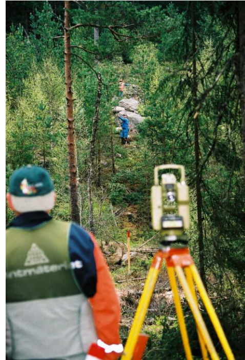
Figure 6.3. Surveying of “new” boundaries