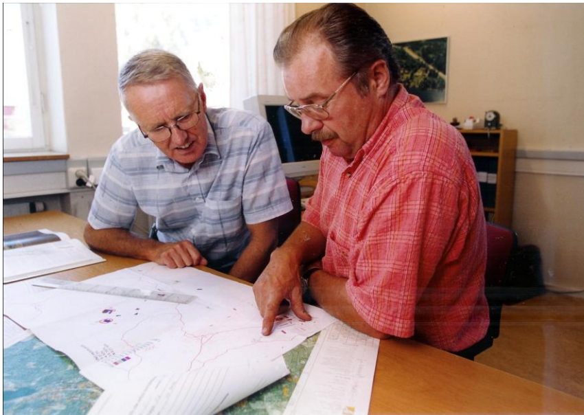
Figure 7.2. Discussion at the “ days of wishes ”

The attitude among the landowners regarding Land Consolidation has also a strong influence on the costs and affects the work with mediation and negotiation with the landowners considerably.