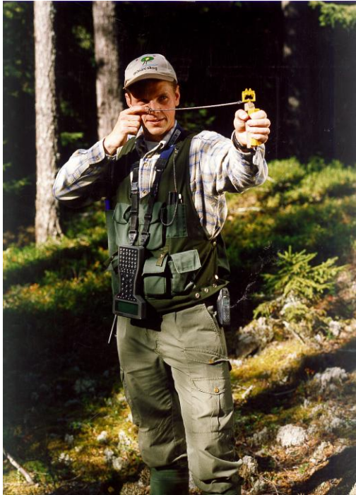
Figure 6.2. Forest valuation