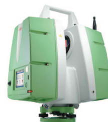
Figure 2 Terrestrial laser scanner Leica ScanStation P20

Indirect georeferencing was done in Cyclone by registering scans from stations 5 and p2 using identical control network points (points 1-4). The mean absolute error of the performed registration was 2.1 mm. The resulting georeferenced point cloud contained a lot of points which represented objects of no interest in this particular case, so "cleaning" of the point cloud was required. Afterwards, this reduced georeferenced point cloud was unified, i.e. the point cloud was resampled with point spacing set to 5 cm. The final point cloud used in the further analysis consisted of a little more than 3 million points.