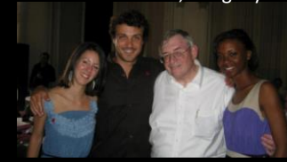
8 th FIG Regional Conference Montevideo, Uruguay