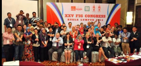
2 nd FIG Young Surveyors Conference Kuala Lumpur, Malaysia