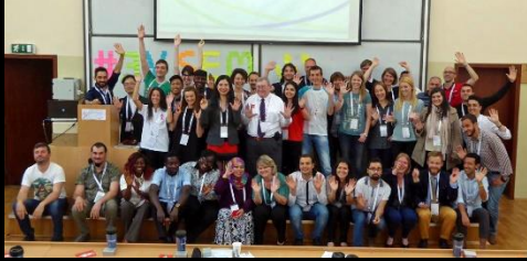
3 rd FIG Young Surveyors European Meeting – Sofia, Bulgaria