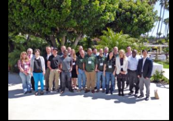
1 st FIG Young Surveyors North American Meeting San Diego, California USA