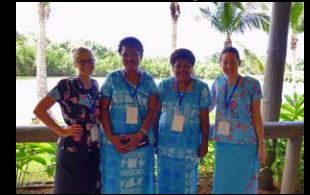
FIG Pacific Small Island Developing States Symposium Suva, Fiji