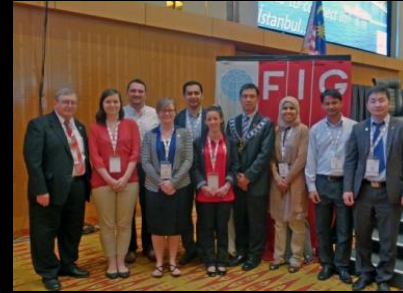
XXV FIG Congress Kuala Lumpur, Malaysia