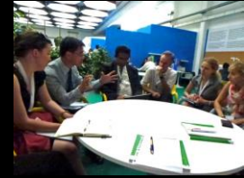
6 th World Urban Forum Naples, Italy