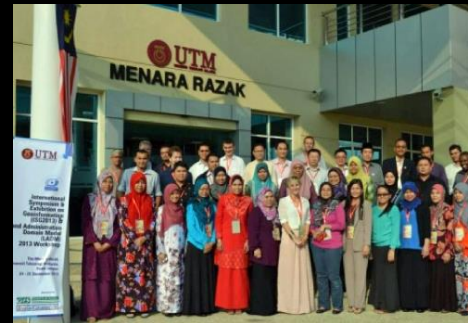
STDM Training - Kuala Lumpur, Malaysia