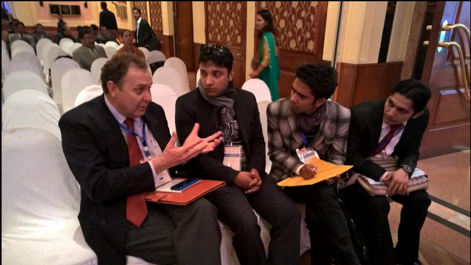
FIG Needs the Young Surveyors