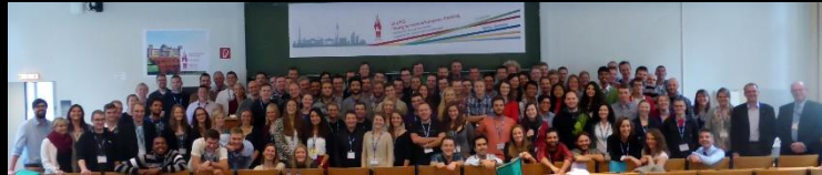
2 nd FIG Young Surveyors European Meeting - Berlin, Germany