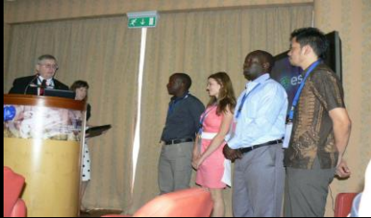
1 st FIG Young Surveyors Conference - Rome, Italy