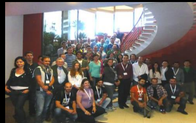
V International Training Course in Topography for Young Surveyors Lisbon, Portugal