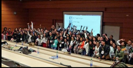
X Congreso Nacional y VII Internacional de Topografía Bogotá, Colombia