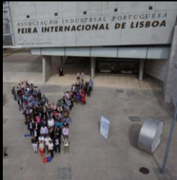
1 st FIG Young Surveyors European Meeting Lisbon, Portugal