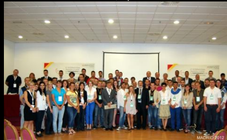
IV International Training Course in Topography for Young Surveyors Madrid, Spain