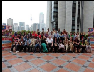
STDM Training Kuala Lumpur, Malaysia