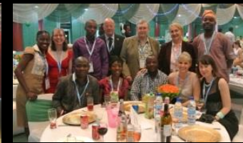
2013 FIG Working Week Abuja, Nigeria