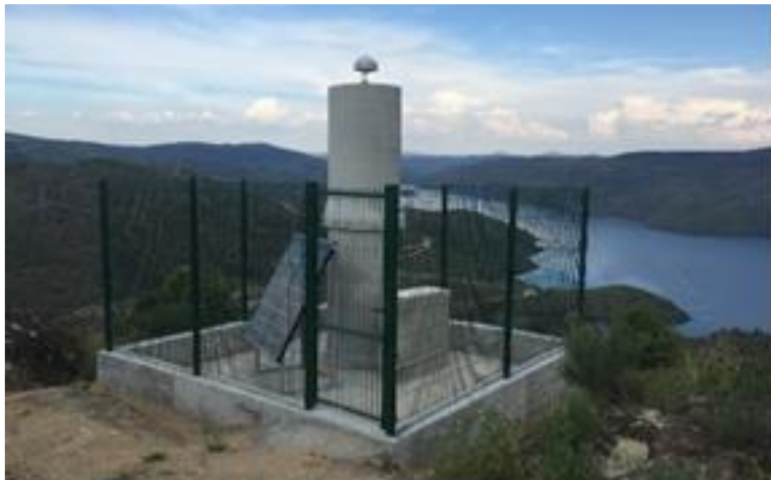
Fig. 2 Reference Station at Baixo Sabor Upstream dam

The high frequency observations supplied by this solution, gives the possibility to configure alarm scenarios that enable the early detection of an anomalous behaviour of the structure.