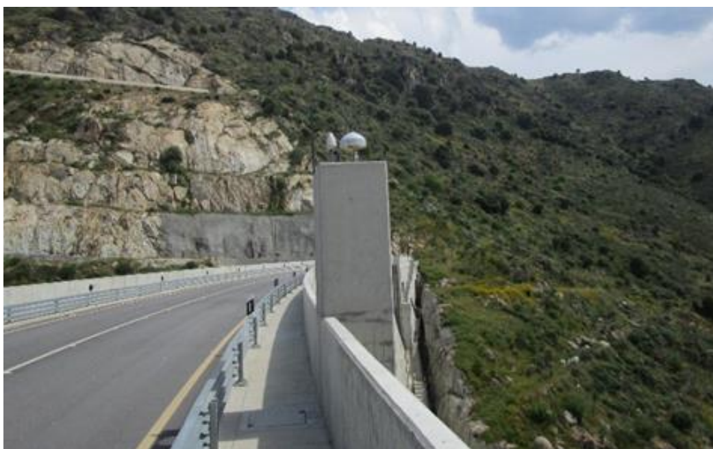
Fig. 1 Object Point at Baixo Sabor Upstream dam

The geodetic monitoring system implemented on the Baixo Sabor Hydropower Project is a technological breakthrough and a major achievement compared to the past. For the first time in Portugal, a dam is continuously observed by methods of spatial geodesy through the use of Global Navigation Satellite System (GNSS). In each of the two dams were materialized three Object Points (OP) by GNSS antennas ( Fig. 1 ) and a reference station outside the influence area of the project ( Fig. 2 ), with good foundations, excellent spatial visibility and (located/situated) less than one kilometre (far) from the monitoring structure. Based on differential GPS (DGPS) techniques, the reference station enables the correction of the continuous spatial observations of the dam's OP. Thus, the displacements are quantified as absolute values, with adjustable observation intervals, where the 24 hour solutions provide displacements with submillimeter horizontal tendencies and millimeter measurement accuracy at vertical component.