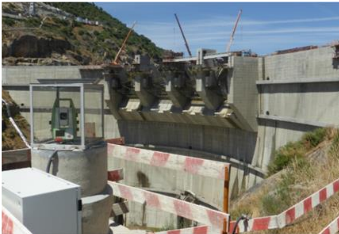
Fig. 4 Robotic Total Station on dedicated survey pillar

These OP, materialized by reflector prisms, are observed from a robotic total station (RTS) at a dedicated survey pillar, PEJ (Fig. 4), whose stability is controlled by four stable reference points installed on the downstream slopes of the valley.