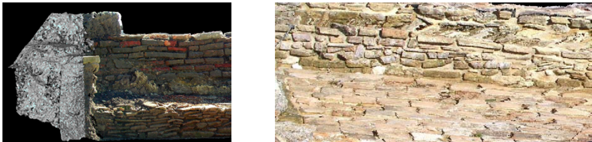
Figure 6: Partially and fully textured mesh of intense relief surfaces

In figure 6, wall masonry detail is shown. Carefully navigating with the software's 3D viewer, verifies the full correspondence of the image resolution and the generated mesh accuracy: the clearly visible gaps between the carved stones are clear in the 3D textured model.