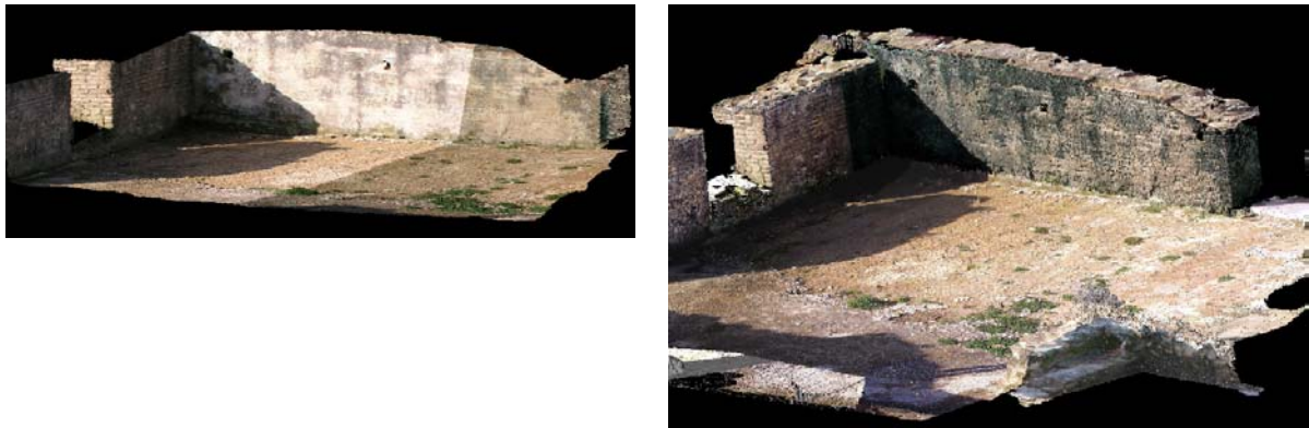
Figure 3: Room RGB Textured Mesh Overview with color discontinuities (left) and inappropriate lighting conditions and without (right)

Figure 3 left, reveals low color resolution which is due to excessive illumination because of direct sunlight incidence. Additionally, the impact of the color discontinuities on the mesh texturing appears. The left portion of this mesh part has a very much higher brightness than the right one. The corresponding images do exhibit the same color balance and contrast / brightness deviations. Figure 3 right, shows the same portion of the surveyed building, after texture mapping of more appropriate camera images (not under direct sunlight incidence) for the left portion, and after color and brightness balancing of the images. Careful inspection of the textured mesh, revealed very high spatial resolution and very detailed RGB texturing.