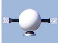
Figure 2: Mensi's sphere targets with corner reflectors.

As mentioned before, unlike other 3D laser scanning systems and the conventional terrestrial surveying instruments, the Mensi GS200 does have leveling capability. A direct consequence of this fact is the introduction of two rotation parameters in the registration of the scan point clouds, in other words, Mensi is using the scanning of the sphere targets for leveling. The scan registration – absolute registration in an external reference system, or relative registration between scans - comprises a total of six parameters, three translation parameters for a translation in space, one rotation for the direction azimuth difference, and two for the leveling difference of the instrument (between scans or instrument stations). The scanning of each sphere target provides three observation equations, one horizontal angle, one vertical angle and one slant distance. Therefore, at least two commonly visible spheres are required for the calculation of the relative geometry between two scans, and also two sphere targets with known position are required for the absolute registration of each scan. It is however strongly recommended to use at least three sphere targets, to enable blunder detection and avoidance, error estimation and increased accuracy in the registration by implementation of least squares adjustment.