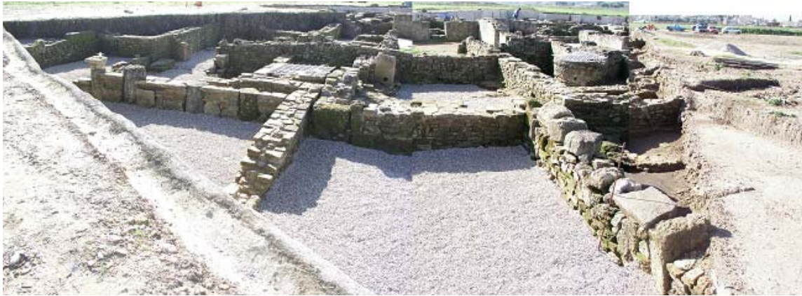
Figure 1: View of the building remains to be surveyed