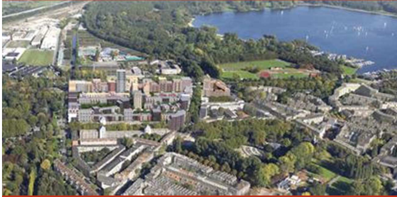
FIG conference 2014, Kuala Lumpur