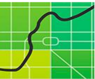
FIG Working Week 2016