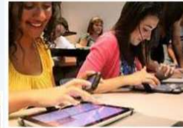
Generation Z (1990-2005)