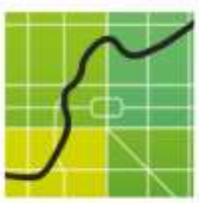
FIG Working Week 2016