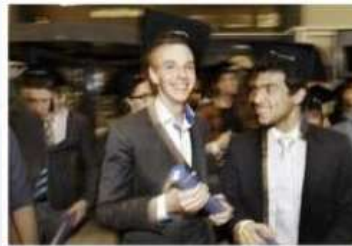
Generation Y (1975-1990)