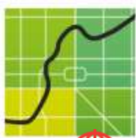
FIG Working Week 2016