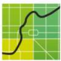
FIG Working Week 2016