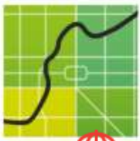
FIG Working Week 2016