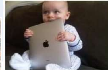
Kids (2005- now)