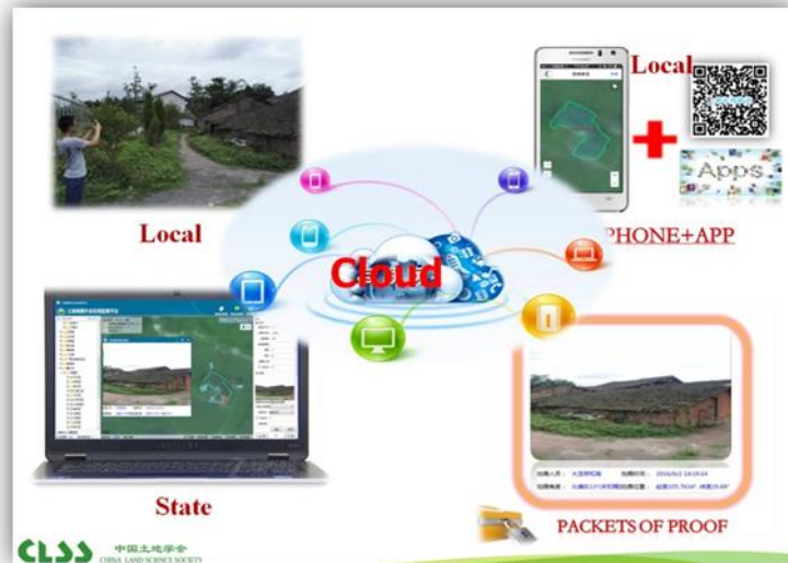
Figure 4 Flow chart of Internet+ field proof provision

changed the phenomena of repeated local proof provision, repeated national onsite field verification, and waste of social resources in the past. It has also become a new model of field survey, proof provision, and online supervision. The flow chart of field proof provision is shown in the figure below.