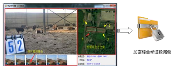
Figure 1: Five-element proof provision

Internet+ survey technology makes full use of mobile Internet, cloud services, and 3S (RS/GIS/GPS) integration technology. It innovates on existing information collection and monitoring technologies. Surveyors use smart phones to collect comprehensive information such as land boundary, onsite photos, GPS location, shooting direction, and shooting time. Survey and proof information are encrypted and transmitted over Internet and then stored on cloud servers. The reviewers conduct reviews and real-time monitoring online, which ensures the authenticity of the survey results while greatly reducing capital, manpower, and time costs during information transmission. For a mobile phone, the positioning accuracy of A-GPS is around 10m, the direction accuracy of the electronic compass is not more than 15°, and the resolution of onsite photos is about 1024*768, which can meet the requirements of survey, proof provision, and verification. The following figure is a schematic diagram of using a mobile device to provide proof of five elements which are person, time, device, coordinates, and direction.