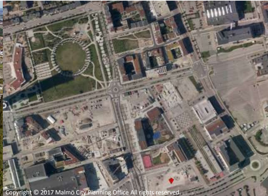
Copyright © 2017 Malmö City Planning Office All rights reserved.