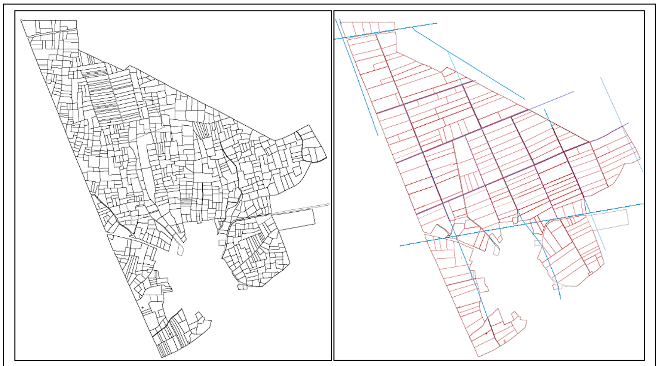
Figure 3: Majority-based land consolidation pilot project in Egri village in FYR Macedonia (2017). Parcel structure before (left) and after (right). The number of land parcels was reduced by a factor 4. Integrated rehabilitation of agricultural infrastructure (roads, irrigation and drainage).

It is the approach of FAO to introduce land consolidation instruments in support of the development of the normal land markets. As discussed in Section 2, agricultural land markets in the 18 FAO programme countries are often not functioning well. Addressing and solving the land registrations problems needs to be an integrated part of the land consolidation process and usually it is recommended to empower the decision making bodies approving the land consolidation project / re-allotment plan also to take decisions on land registration issues related to the landowners and land parcels participating in the land consolidation projects. Without the mandate to adjudicate uncertainties in ownership, it would often not be possible to implement and register the re-allotment plans with the new parcel layout after the land consolidation projects.