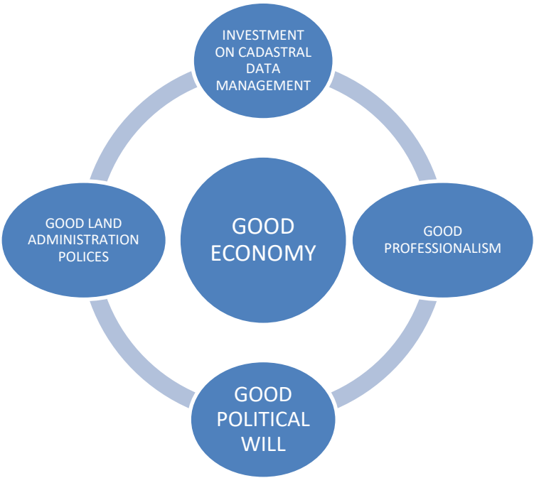
FIGURE 1: The Attributes for Good Economy for the State are outlined in the cycle of interplay.

Just TEN PER CENT of total Land Related Revenue can have geometrical positive multiplier effects on the state economy.