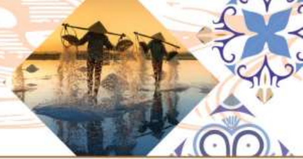
FIG Africa Regional Network - an academic network for Africa

"Geospatial Information for a Smarter Life and Environmental Resilience"