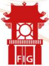
FIG WORKING WEEK 2019