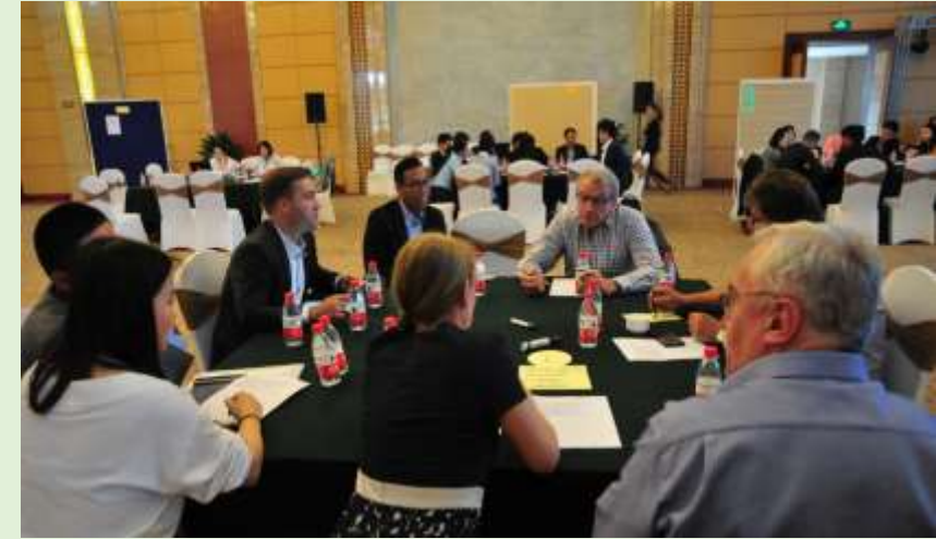
Participants are working in a group