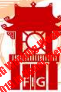
FIG WORKING WEEK 2019

Presented at the FIG Working Week 2019, April 22-26, 2019 in Hanoi, Vietnam