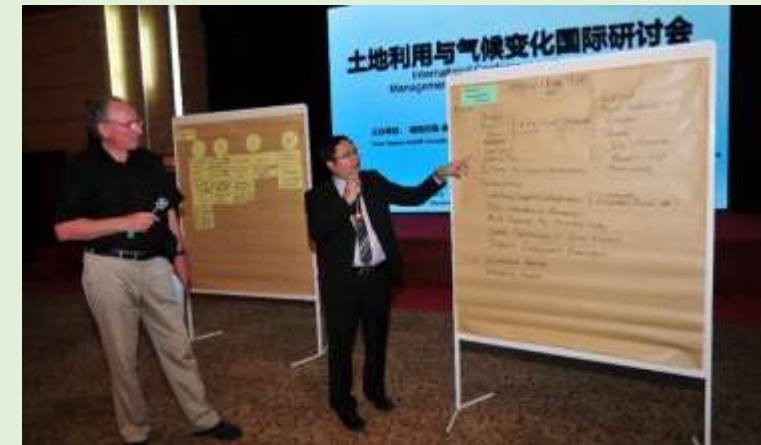
A group presenting their findings