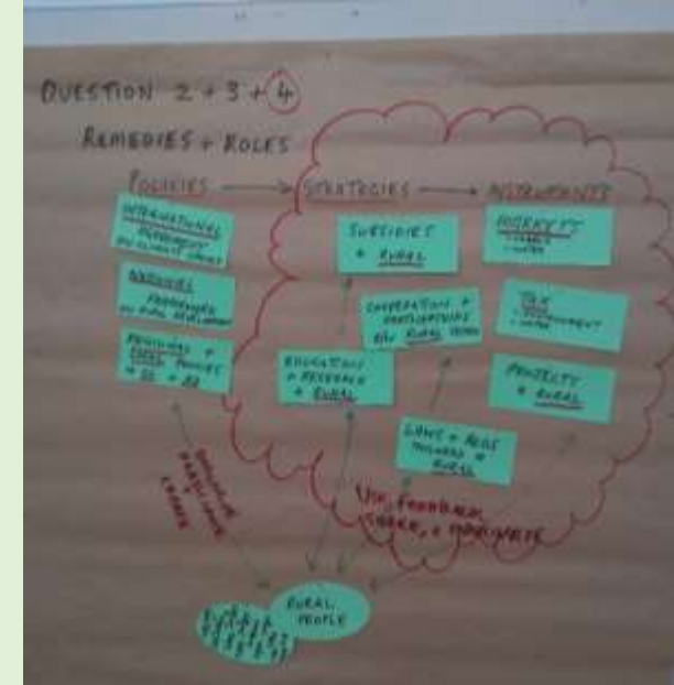
Findings of a group