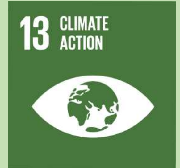
SDG 13: Climate Action