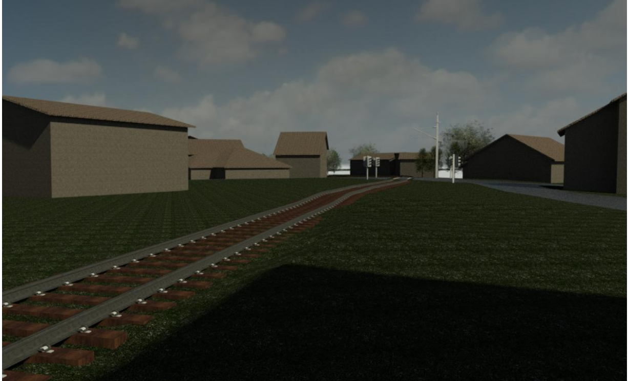
Figure 8: Rendered BIM model- railway and its environment

Figure 8 shows one part of rendered BIM model- railway and its environment. This model provided plenty of views and renders, such as wire-frame model, intensity model, classifications by height and other characteristics. Also, this 3D smart model is varying, ie. some dimensions or materials could be changed, and that will affect the calculations and further processes.