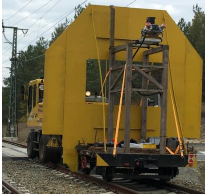
Figure 4: Mounted scanner on the train

The laser scanner that was used is Trimble MX8, and its main characteristics are shown in the Table below (URL 1):