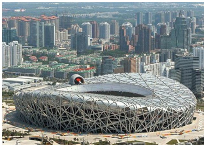
Figure 2: The Bird's Nest Stadium in Beijing

There are many other projects where BIM is also used: Seoul Design Square Project, Hong Kong Oceansheigs Project, Beijing Poly Corporation Headquarters Project, Kuala Lumpur