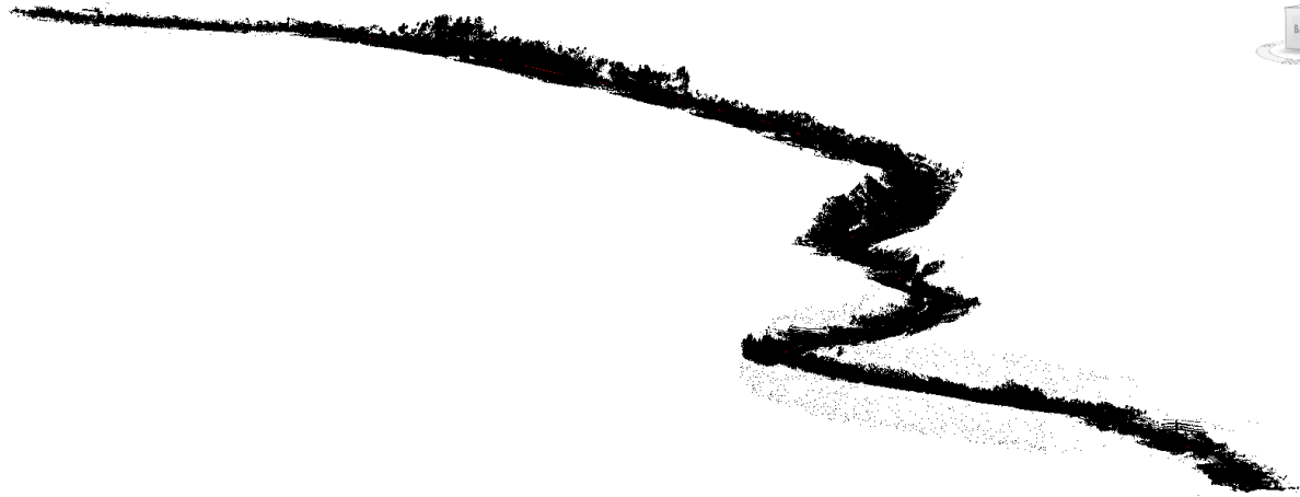
Figure 5: Point cloud of surveyed area

After preparing the point cloud for further work, ie. point cloud matching, reduction of the points to facilitate manipulation is performed. Even after these steps, the area of interest was large so it has to be divided into sectors and modelled part by part. All of these steps were performed in MicroStation software package. That is a CAD platform that generates 2D and 3D vector graphic elements, including BIM modelling (URL 2).