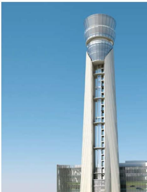
Figure 1: The control tower of Indira Gandhi International Airport

Bird's Nest Stadium in Beijing (Figure 2) is a project that was created in 2003. The stadium is constructed of 50,000 tonnes of steel, its length is 320 m and height is 60 m. It has been built for 4 years with over 17 000 hired workers and the main used technology was BIM (Vujaković, 2019).