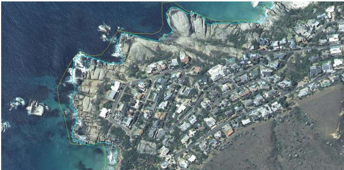
FIGURE 4: AN EXAMPLE OF INADEQUATE DATA OF THE HIGH-WATER MARK AT LLANDUDNO. THE YELLOW LINE REPRESENTS A HIGH-WATER MARK DETERMINATION CURRENTLY IN USE, BASED ON OUTDATED AND INACCURATE DATA. THE BLUE LINE REPRESENTS MEAN SEA LEVEL EXTRACTED FROM CURRENT LARGE-SCALE RECTIFIED IMAGERY.

of the sea running up against the coast, it is not an elevation contour. Therefore, topographic and Bathymetric LiDAR data based on a tide gauge height will give, at best, only a rough, approximate position substantially seaward of the true high-water mark.