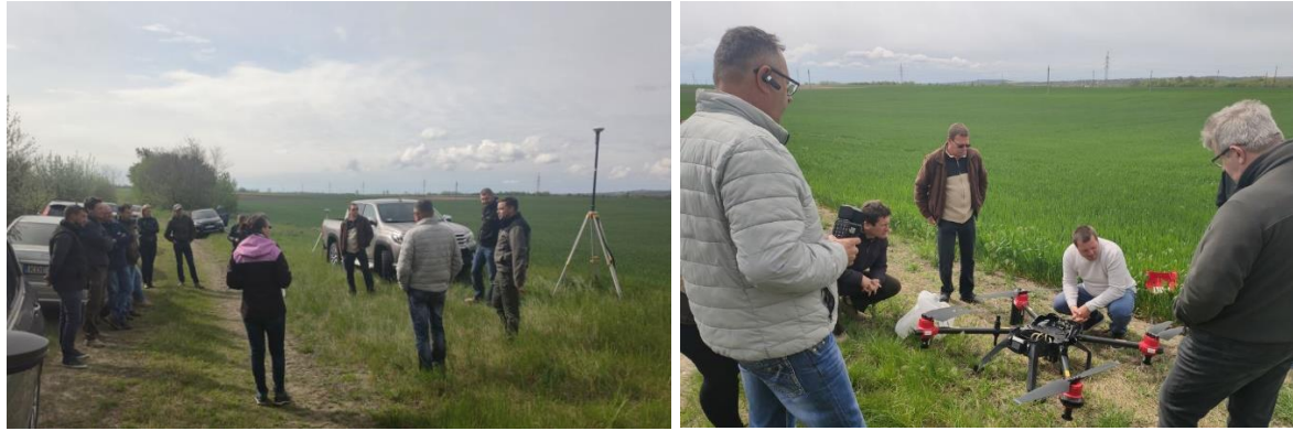
Fig. 2. Dron and GNSS demonstration

We think it is important not only to convey knowledge, but encourage students to address the topic themselves. Thus, in the moodle e-learning system developed at the university, we require the submission of two tasks; one of these is a mandatory task and an alternative. In the latter case, you can choose from three alternatives: writing an essay based on your own experience; Rinex file analysis, measurement planning. These solutions worked during the pandemic.