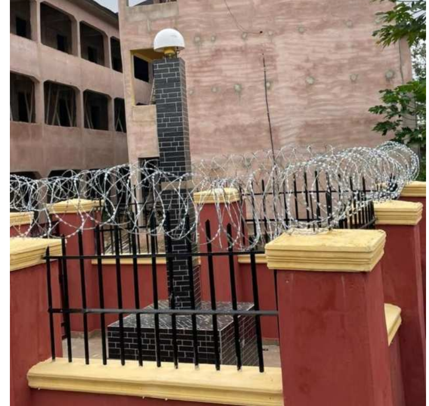
SOGPOS Abakaliki CORS (Monument Installation)