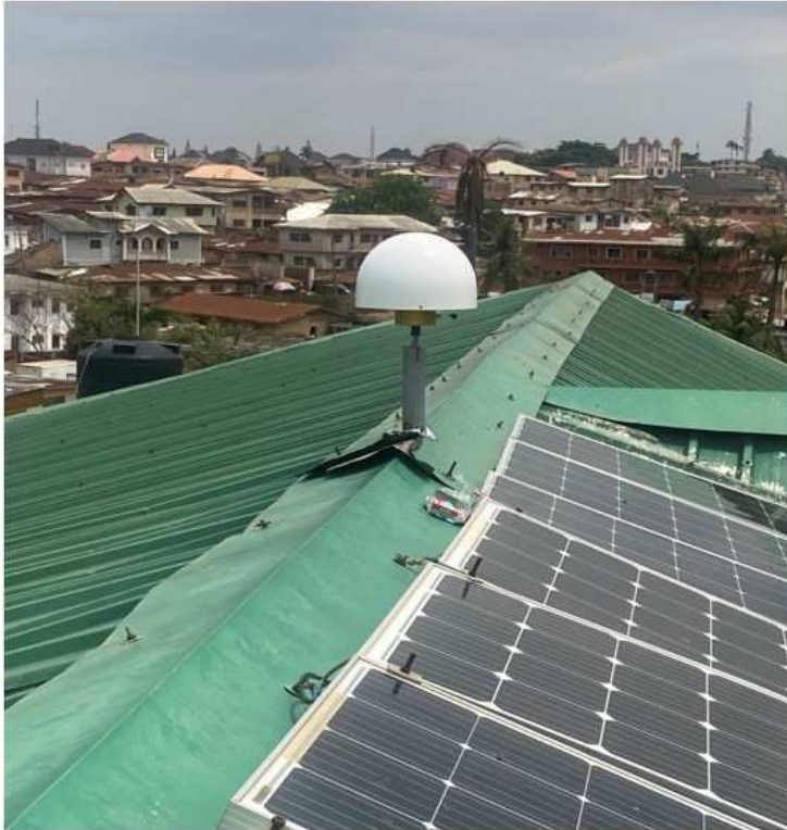
SOGPOS Ibadan CORS (Roof Top Installation)